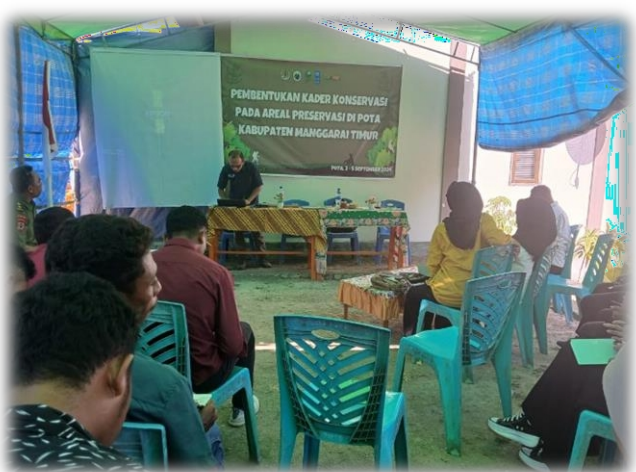
Figure 5 & 6 : Participants follow the presentation of Komodo monitor lizard ecology material in Pota