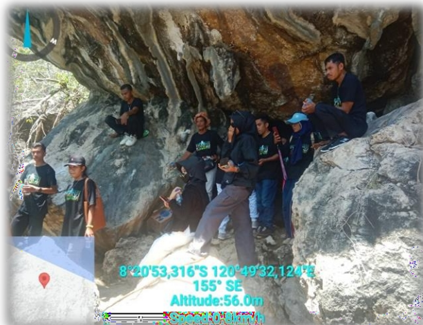
Figure 11&12 : Komodo monitor lizard habitat in Lake Rugu