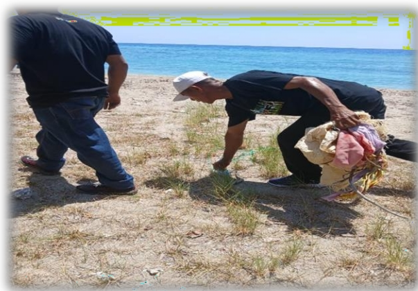
Figure 7&8 : Komodo monitor lizard habitat introduction and garbage cleanup at Tanjung Watu Pajung