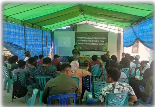
Picture 1 & 2: Opening Ceremony of the Conservation Cadre Formation Activity in Pota