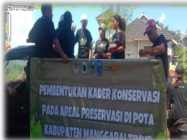
Figure 9&10: Komodo monitor lizard habitat and participants' journey to Tanjung Watu Pajung