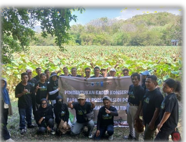
Picture 3 & 4 : Participants with the Organizing Committee of the Conservation Cadre Formation Activity in Pota