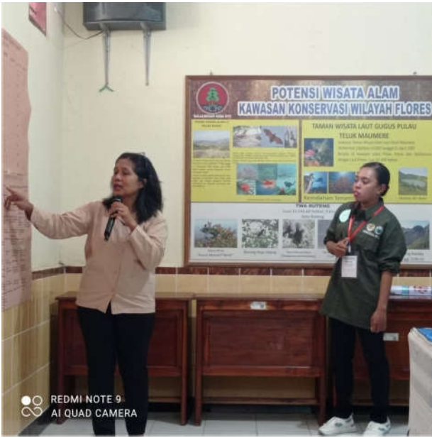
LEARNING IN THE CLASSROOM