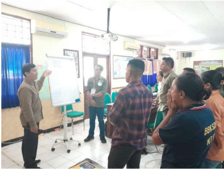
LEARNING IN CLASS