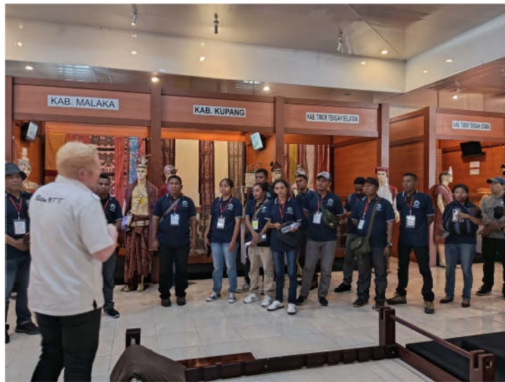
VISIT TO DEKRANASDA