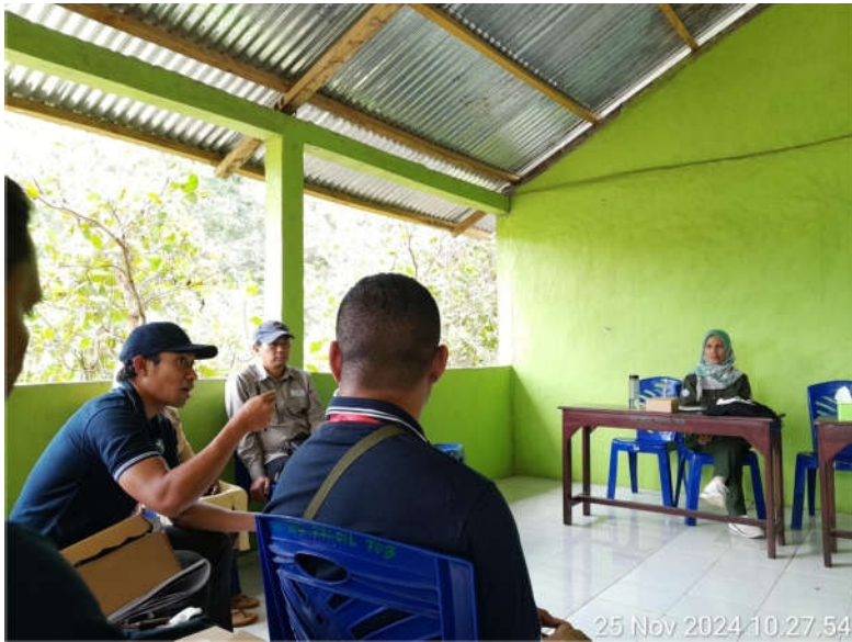
VISIT TO KTH PALOIL TOB