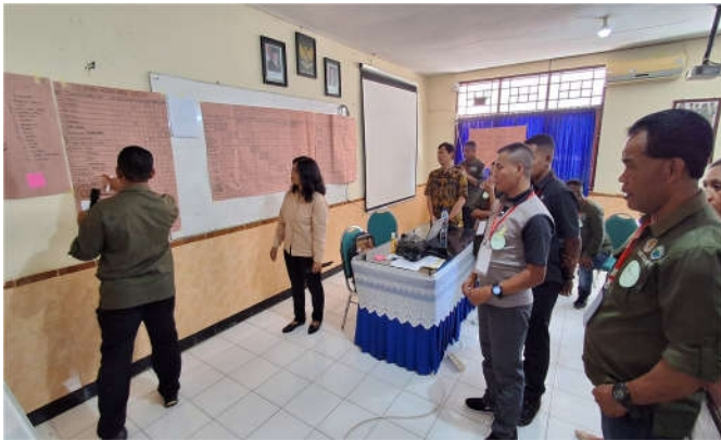
LEARNING IN THE CLASSROOM