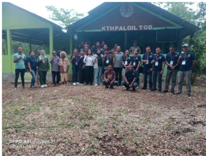
VISIT TO PALOIL TOB