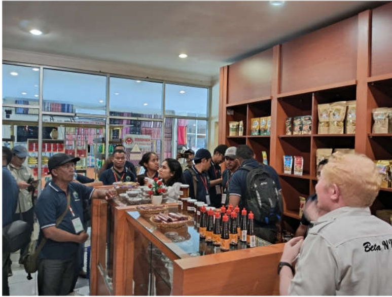
VISIT TO DEKRANASDA