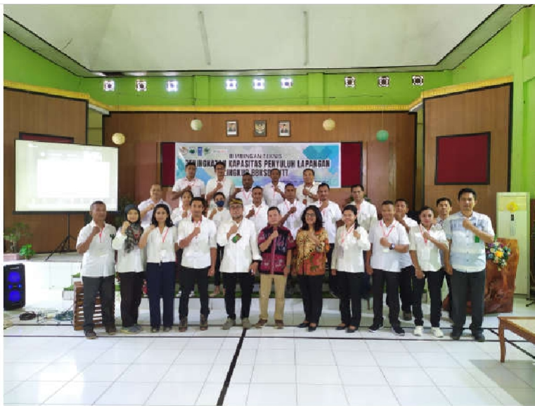
OPENING OF BIMTEK