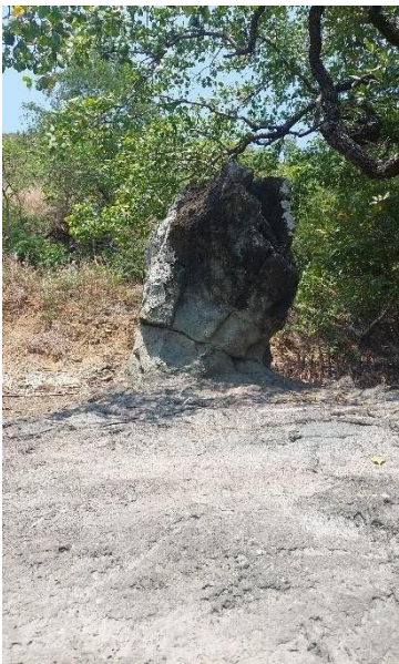
Figure 5. Watu Wangka site in Sambinasi raya

Afterwards, they sailed again and arrived at Nanga Lolong (Damu), where they sang, "Keos Zongpelo Konong Nanga Lolong rede tanggo ende," meaning that Zongpelo's boat stopped at Nanga Lolong, planting thorny leaf plants as a fortress. They continued their journey to Lolang Bay, then moved west to Onto (Torong Padang Peninsula). At this place, the seven brothers again released Telo Manuk and Kongkak Woza, and both sank, signaling that this was the place of their final journey.