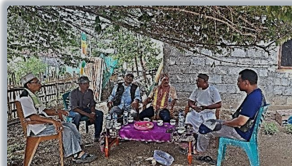
Photos 1,2. Recording traditional speech at the dorp Damu's house (ki) and at the tribal leader's house (ka)

Some of the important things noted from the dialog with the customary chiefs and traditional leaders in each dorp are: