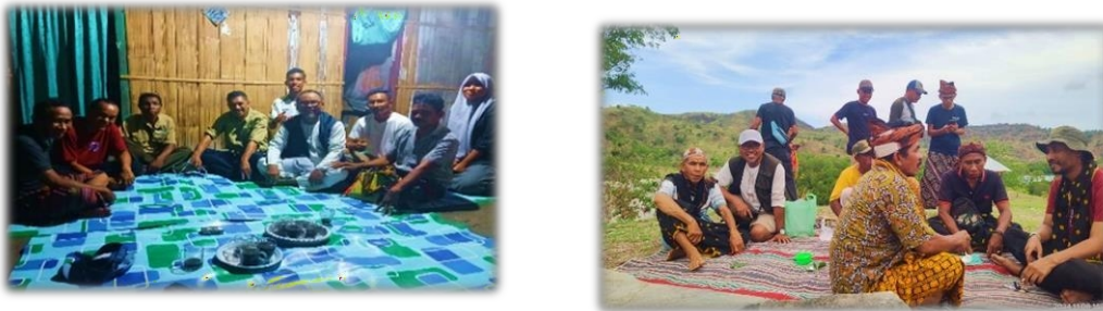
Figure 3,4. Recording traditional speech at Dorp Ruki's house (ki), Pintu Manuk traditional event (ka)