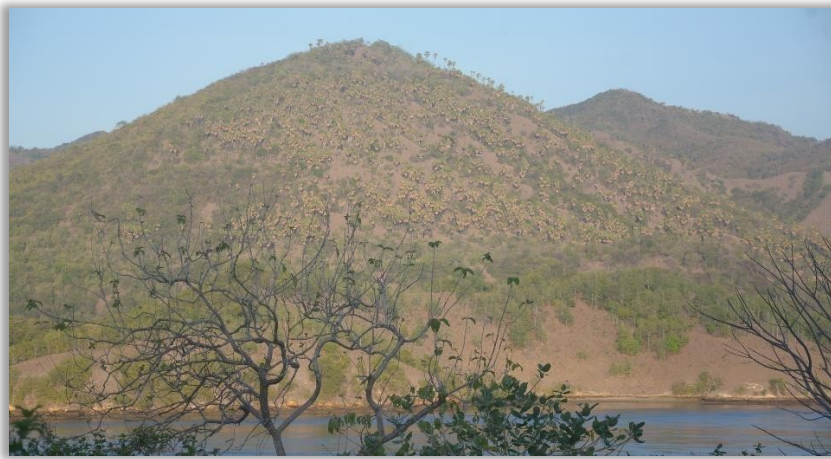
Land cover profile in the Sambinasi Raya area of Riung sub-district

According to KLHK (2019), the dominant land cover in North Flores includes forest and savanna, with significant primary forest (approximately 35,642 ha) mostly spread across state protected forest areas and community lands. Given the importance of these primary forests, long-term forest management and conservation requires close collaboration between the government agencies that manage the forest areas and the indigenous communities that have rights and authority over the land.