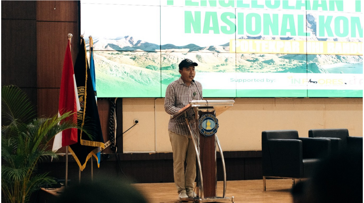
Figure 1: Report of the chief executive of the Komodo National Park Management Dissemination and Junior Park Ranger Program.