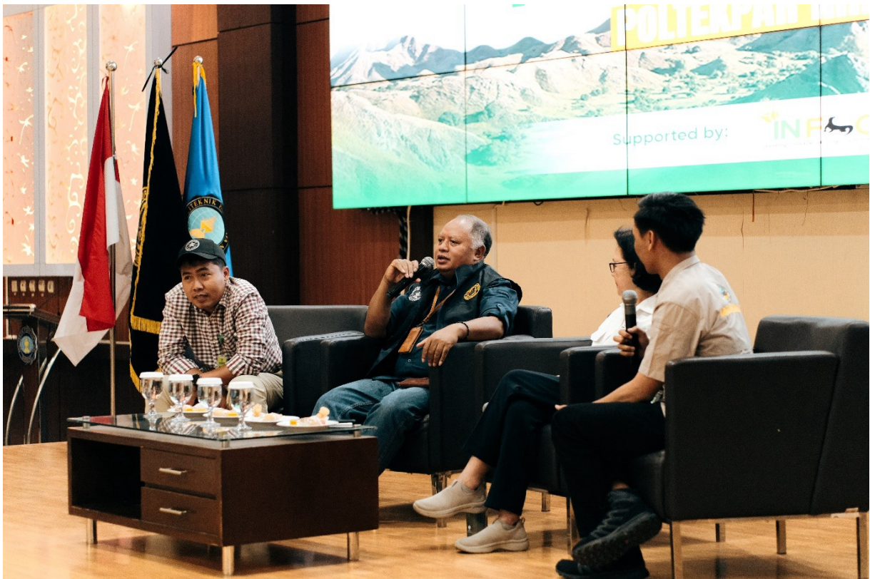
Figure C. Question and answer session between students and Komodo National Park Office