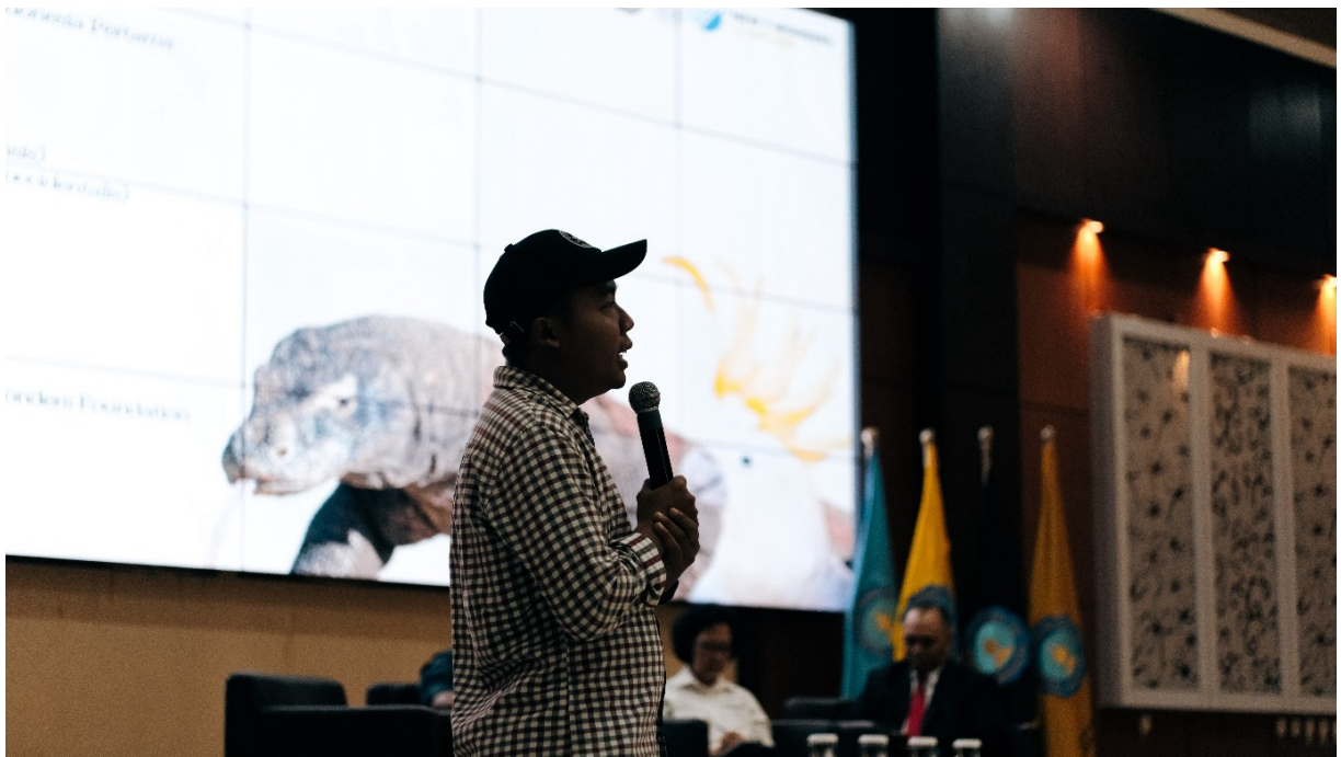
Figure 4. Presentation of Komodo National Park management material