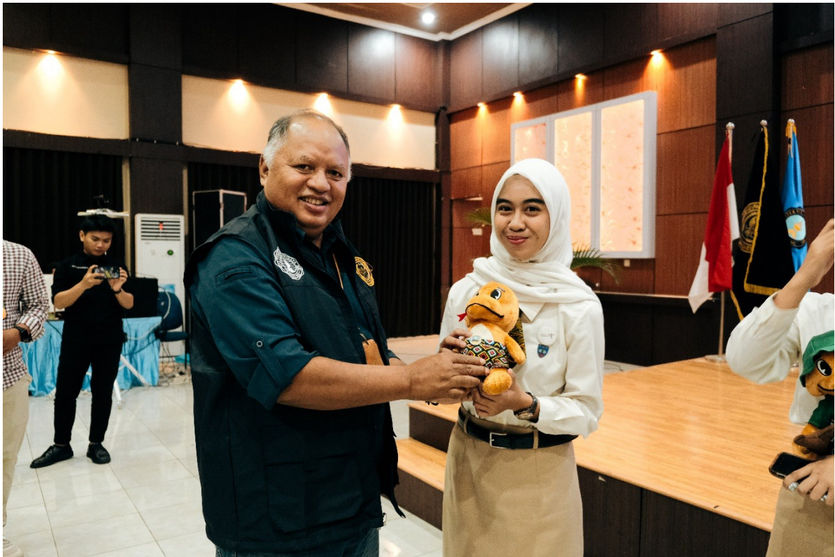
Door Prize Distribution Session to the winners