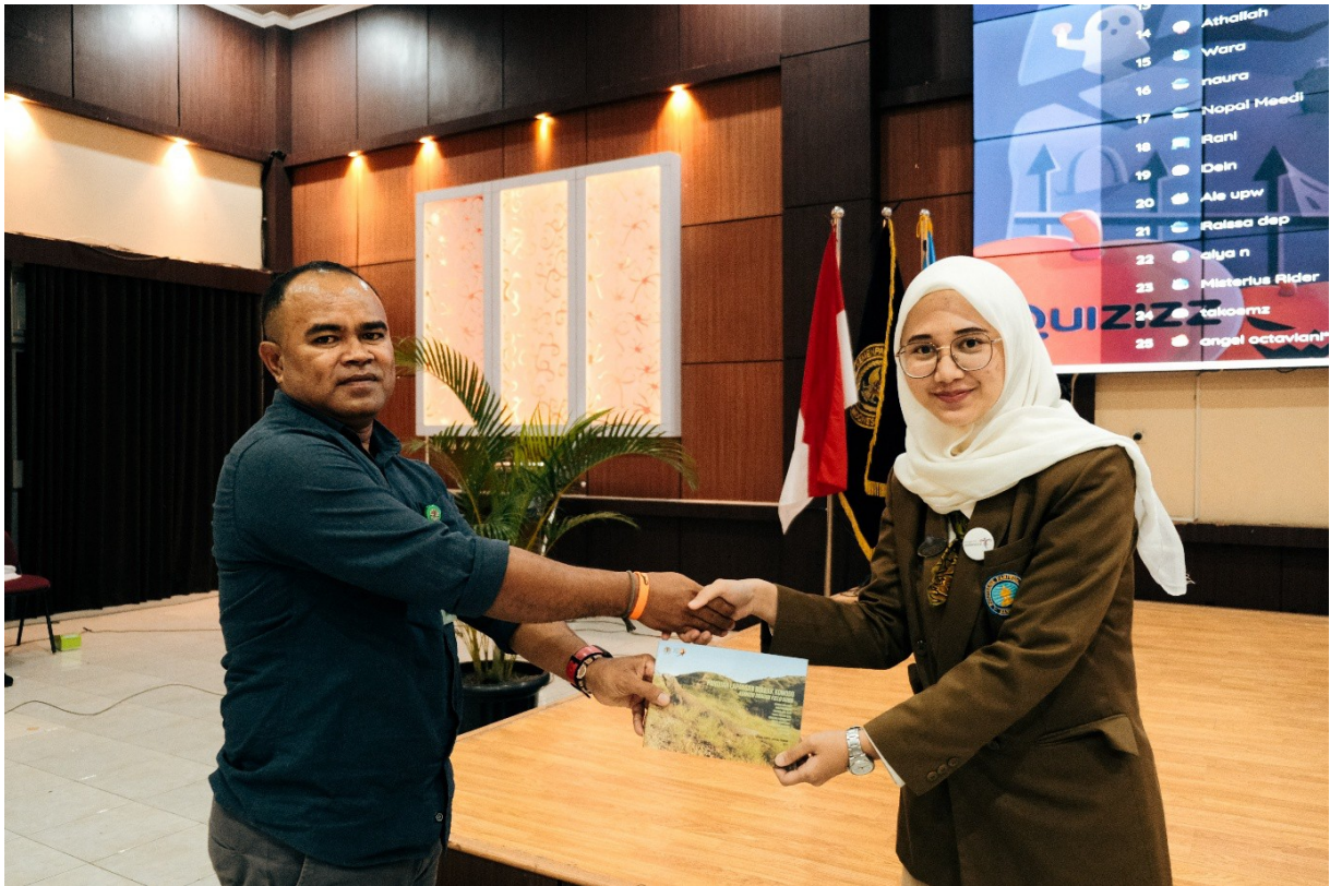
Door prize distribution to the quiz winners