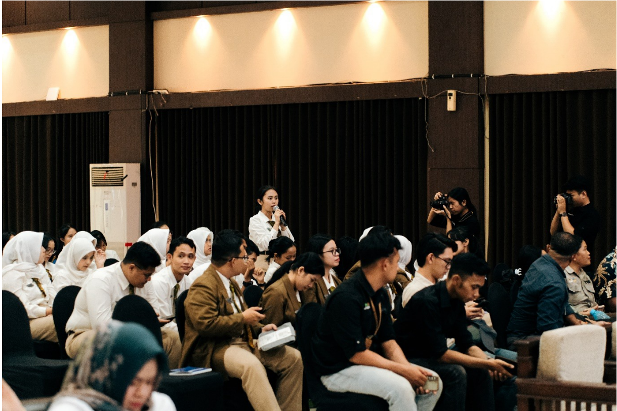
Figure 7. Question and answer session between students and Komodo National Park Office