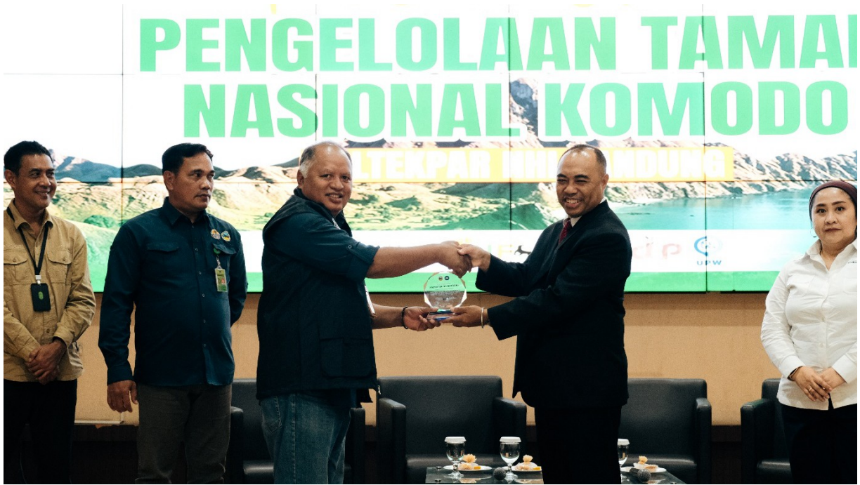
Symbolic handover of souvenirs by the Head of the Komodo National Park Office to the NHI Bandung Polytechnic