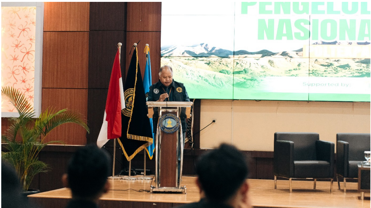
Head of Komodo National Park Office's remarks