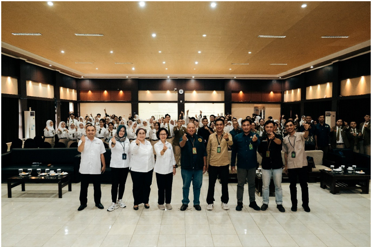
Picture 10. Photo session with students and lecturers of DEP and UPW Study Programs